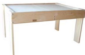
Assembled Activity Table