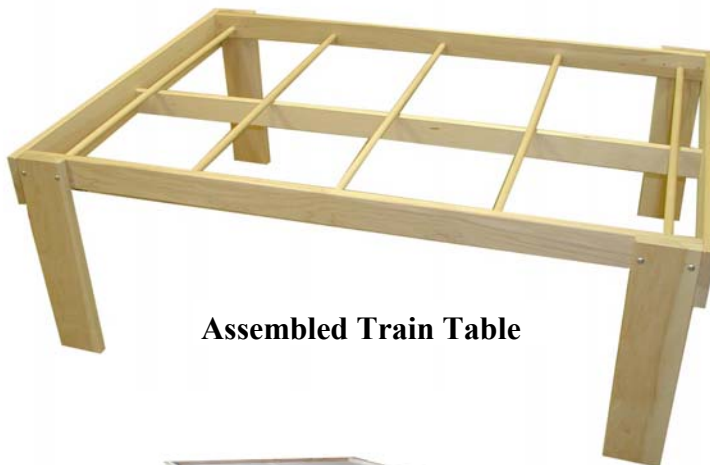
Assembled Train Table

Appropriate tops provide a secure play surface for trains and other toys, and will remain in place during use.