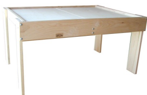
Assembled Activity Table