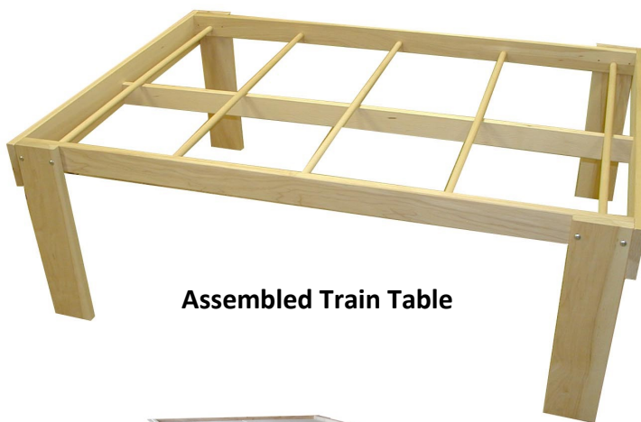
Assembled Train Table

Appropriate tops will provide a secure play surface for trains and other toys, and will remain in place during use.